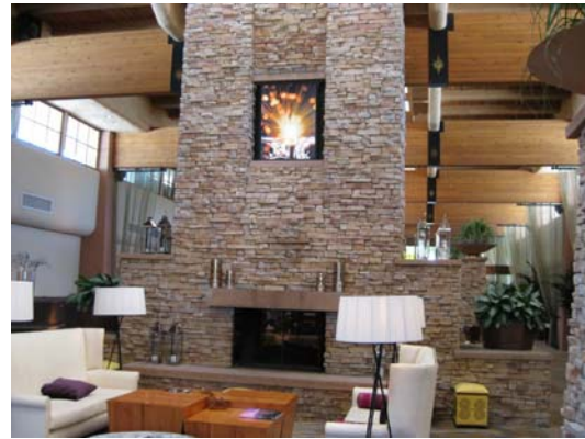
The Lobby Entrance

Call the hotel at 1-800-556-6087 or locally at 480-945-7666 to book your room. Tell them you are with the GE Computer Department Alumni group in order to obtain the discounted rate.