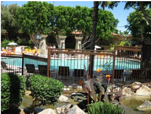
The Swimming Pool

Thinking of those of you in cold country, here is a picture of the swimming pool at the Firesky.